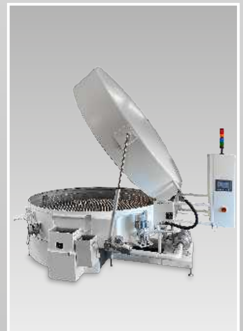
Machine examples Toploader Series SP