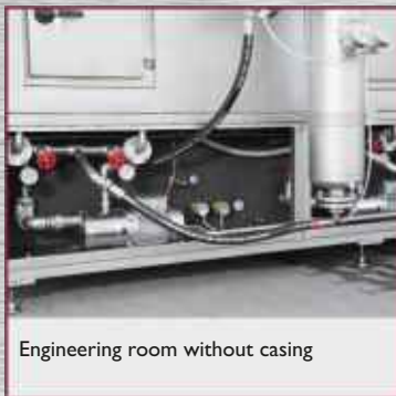
Engineering room without casing