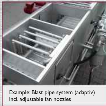
Example: Blast pipe system (adaptiv) incl. adjustable fan nozzles