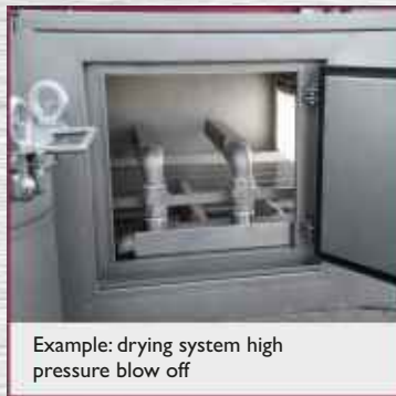
Example: drying system high pressure blow off